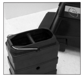
Patented dual lift-off recovery buckets (one shown) provide quick and convenient emptying.

Productivity — The Stallion 12 SC will cover 1,714 sq ft per hour (coverage figures provided in the ISSA 447 Cleaning Times).