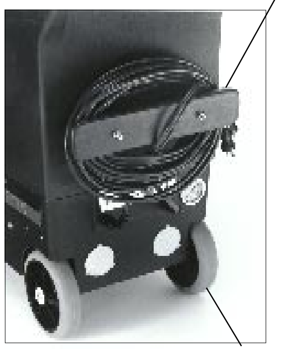
Large, 8" non-marking back wheels make transportation on stairs easy

Each machine comes with a built-in cord wrap for convenient storage of cords /