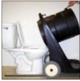
Tip-dispose bases empty easily into any drain up to toilet height.

4 Large rear wheels and front casters make the Colt extremely maneuverable.